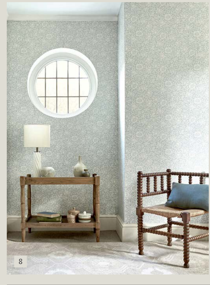
For further information, images or product requests, please contact: Style Library Press Office \begin{tabular}{ll} \hline \end{tabular}

T: +44(0)1895 221005 E: press@stylelibrary.com